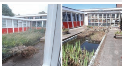
Before / After

The Site Team have done a terrific job around the site during lockdown, making repairs and preparing areas for summer works. One job that has required attention for some time is the tidying and renovation of the pond, which is now complete. We're sure you'll agree that it is quite a transformation.