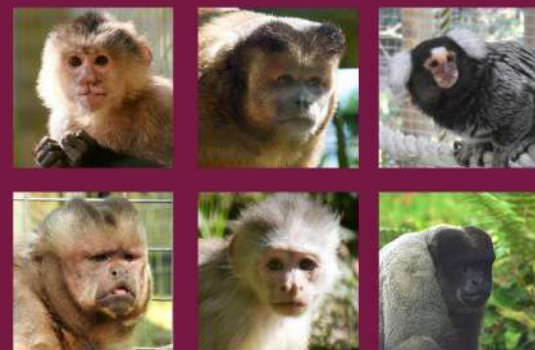
Year 12's adopted monkeys

We hope these monkeys continue to thrive and have a better life thanks to the wonderful support of students, staff and parents who donated.