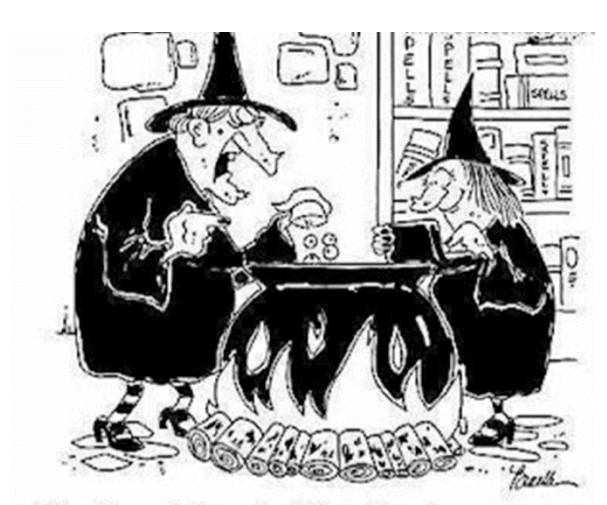
"You have it so easy. When I was your age, we didn't have spell checkers."